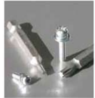
Pan Head 6 Lobe Recessed SEMS

EACH PACK OF 200 PAN 6 LOBE Contains One only ( 6 Lobe ) Driver Bit